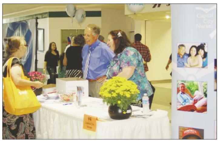
Representatives from Capital City Nurses meeting with potential employees