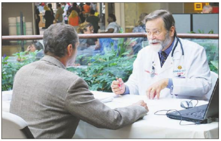
The Resume Doctor was on hand to evaluate resumes of applicants and offer suggestions at no cost.