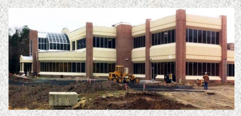
New One-Stop Job Market 31901 Tri-County Way